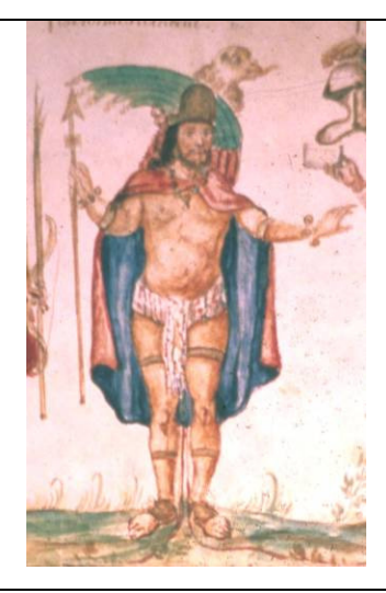
Figure from one of the Mendoza Moctezuma Genealogies (Archivo General de la Nación, México; Tierras 1593)<sup>16</sup>