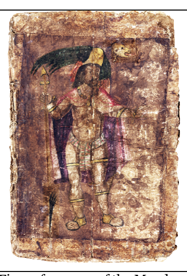
Figure from one of the Mendoza Moctezuma Genealogies (Cover, Techialoyan Ms. from Tolcayuca, Hidalgo)<sup>17</sup>