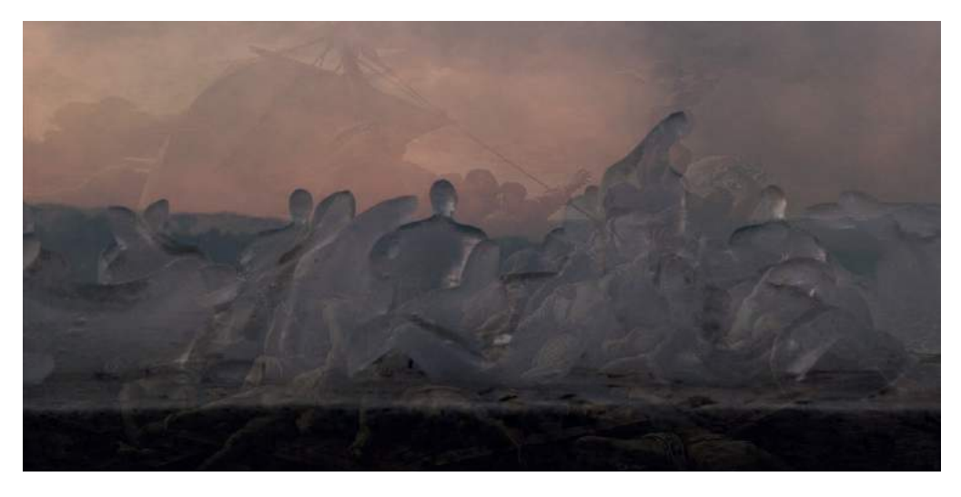
Historical Interweaving. Photographic overlap of Minimum Monument and Le Radeau de la Méduse (1818/1819) by Théodore Gericaut. By Néle Azevedo.

Originally conceived to interrogate the concept of the monument, Minimum Monument is an anti-monument. However, its images received worldwide attention after the Gendarmenmarkt performance in Berlin on September 2009, where it became a symbolic warning of the dangers of global warming and raised the interest of audiences beyond the circuits of contemporary art. This expanded meaning in reading the work was integrated into the original concept of Minimal Monument , broadening its interrogation in two areas: —the threats generated by global warming and climate change; —another way of celebrating the public memory of historical events.