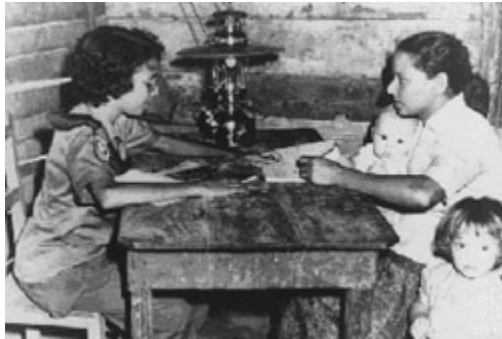
Young literacy brigadista teaches a campesina . 3

“At the time of the Campaña de Alfabetización thousands and thousands of Cubans were illiterate. The Campaña was a definitive point when everyone could better themselves.