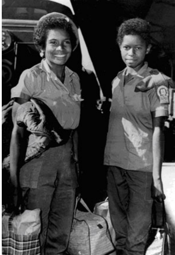
Literacy brigadistas in Brigada Conrado Benítez 5

“One young woman I met, a mother of two children, Her husband wouldn’t allow her to leave the house to come to class! This was an example of machismo at that time! I gave her lessons in her home, so that she, too, could learn like the others.”