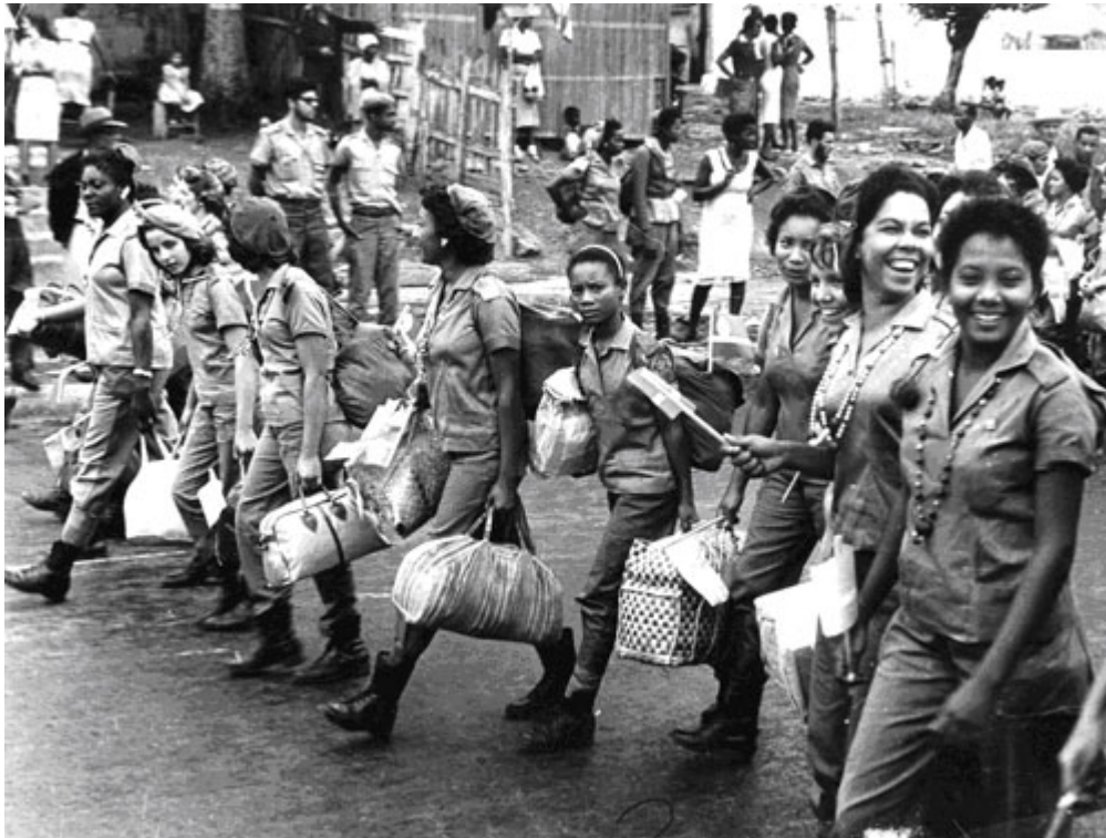
Young literacy brigadistas en route to the countryside, 1961 1