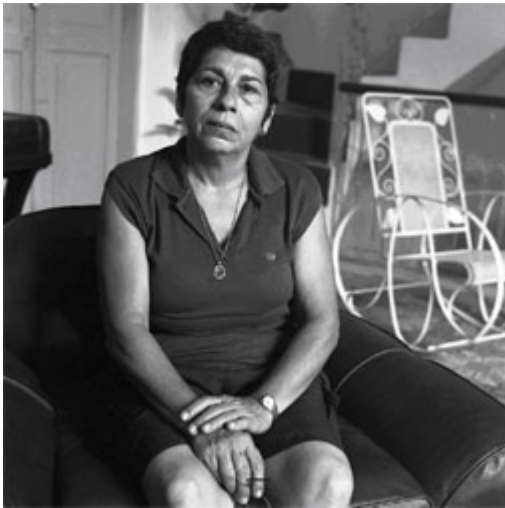
Moraina, Ciego de Avila