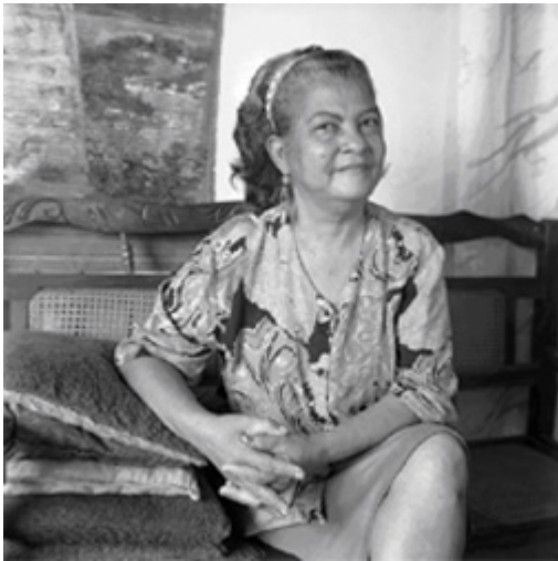
Enoida, Santiago de Cuba

While many of the Revolutionary heroes have been mythologized as male, more than 50% of the 250,000 maestros voluntarios in the Campaña de Alfabetización were women. As the cultural and social mosaic of pre-revolutionary Cuba provided little opportunity for women to take on active lives beyond the expected familial role of wife/mother, the Campaña de Alfabetización marked a definitive change in the way the young literacy brigadista would begin to view her world. As women's contributions to social development are often overlooked, cultural information is historicized as these women reflect back upon their role in a collective event, their participation itself the pedagogical moment.