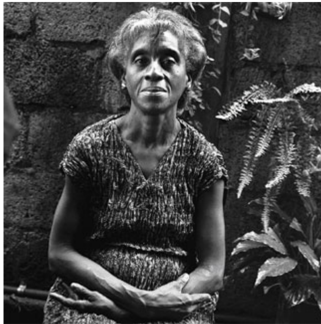
Bienvenida, Ciego de Avila

“The Campaña left a definite mark on my life...it changed everything for me.