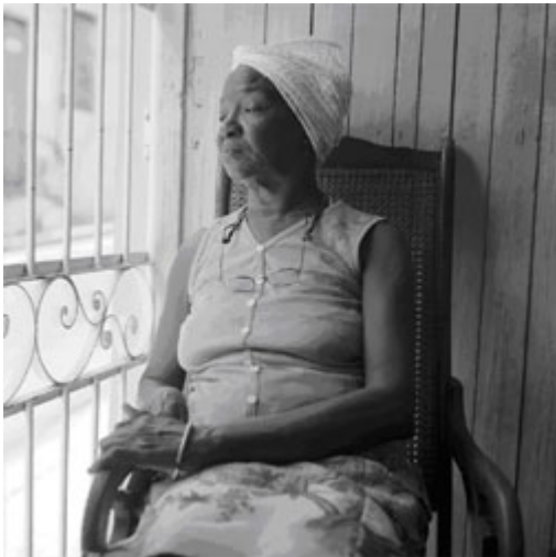
Oneida, Santiago de Cuba