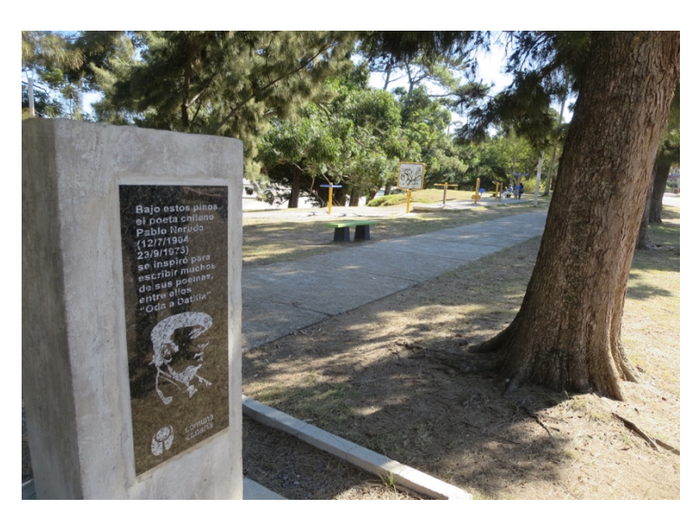
Obelisk dedicated to Neruda in the Comuna Canaria in Atlántida, Uruguay

Bajo estos pinos el poeta chileno Pablo Neruda (12/7/1904 23/9/1973) se inspirió para escribir muchos de sus poemas, entre ellos "Oda a Datitla"