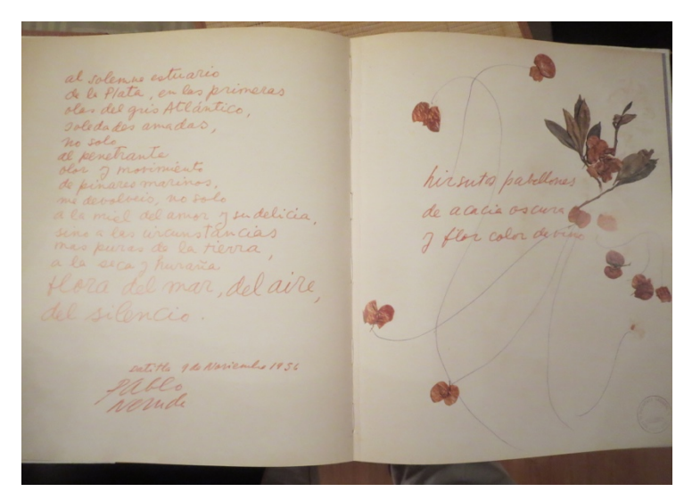
Image 1: 2002 facsimile edition of the 1956 'Oda a las flores de Datitla'

This chapbook thus displays the words of Neruda's poem, "Oda a las flores de Datilta." The poem's title is also the title of the chapbook and the title is set out on the cover in dark red with black ink outline upon the painted (light reddish water color) image of a leaf which is outlined in black ink but with interior veins of the painted leaf highlighted with white paint or ink. The leaf so illustrated by Neruda appears (to the present author) to be a variety of an Australia-derived eucalyptus species, seeds and cuttings for which were planted in and around Atlántida from 1908. Below this image of the leaf are the words "Pablo Neruda." We can then note the reference to the lines, "Arenas de Datitla! junto al solemne estuario de La Plata, en las primeras olas del gris Atlántico," which we can recognize from the usage in the modern-day obelisk at Atlántida. There follows overleaf an illustrated page featuring a photo of a small leaf and words in brownish-red pencil "Oda a las flores de Datilta," followed by the words "versos de Pablo Neruda" and below this, "herbario de Matilde." Thus, the couple project how they wish to attribute the respective responsibilities for the production. A dedication follows which reads "Dedicados a Olga y Alberto Mántaras," as well as a further set of wording which links the Mántaras couple to the imagined place Neruda has called Datitla: "A los Olgobertos que también son plantas de Datitla," written in white on a blue background.